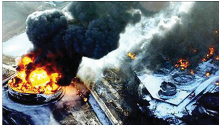
Aftermath of Buncefield explosion 11th December 2005

Manderstam carries out global benchmarking studies in process industries enabling our client's management to critically review the performance of its asset against its industries top performers. Manderstam holds a global data-base of cost and operating performance indices for all process equipment that has been maintained and compiled from over 200 process plants in the last 15 years.